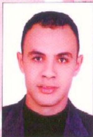
Photograph of holder of certificate: