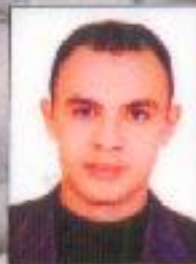
Photograph of holder of certificate: