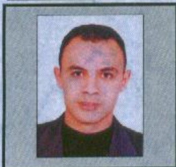
Seal of Issuing Body.