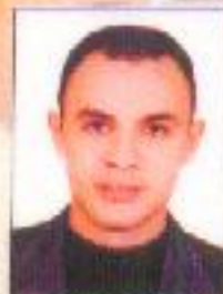
Photograph of holder of certificate: